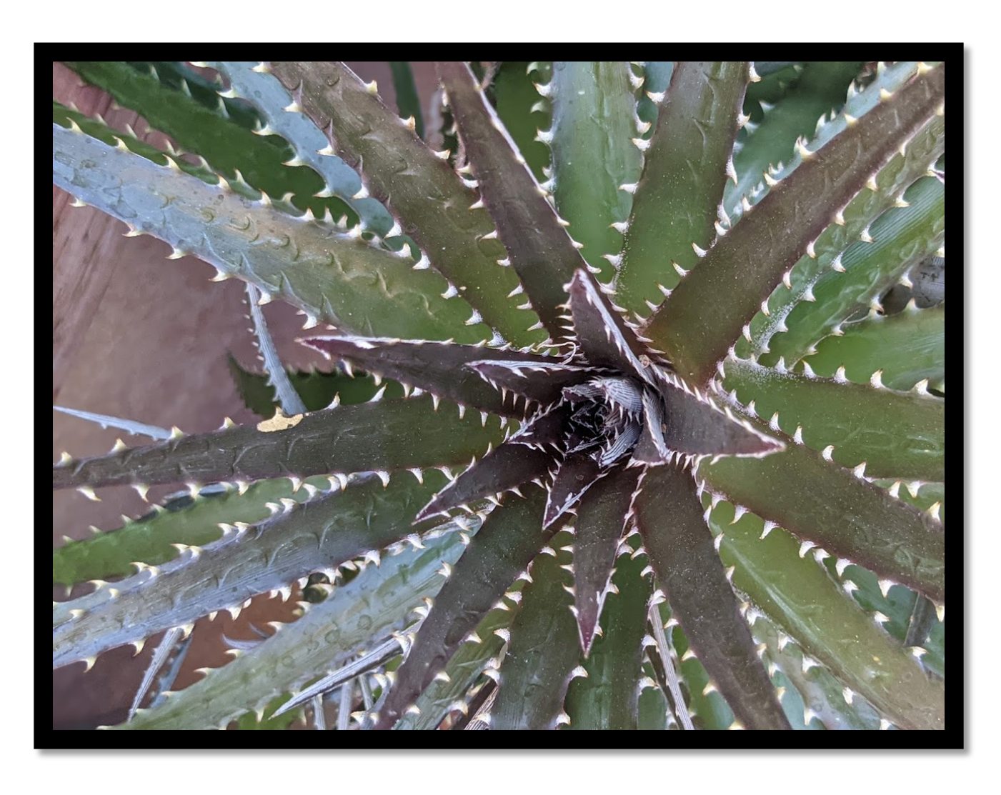
Dyckia hybrid Plant and photo submitted by Felipe Delgado