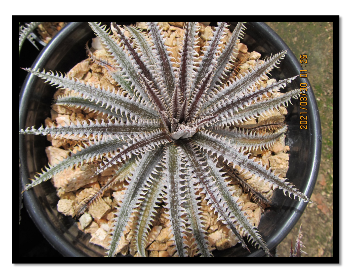
Dyckia hybrid – Tracking Code 12D Plant and Photo submitted by Bryan Chan