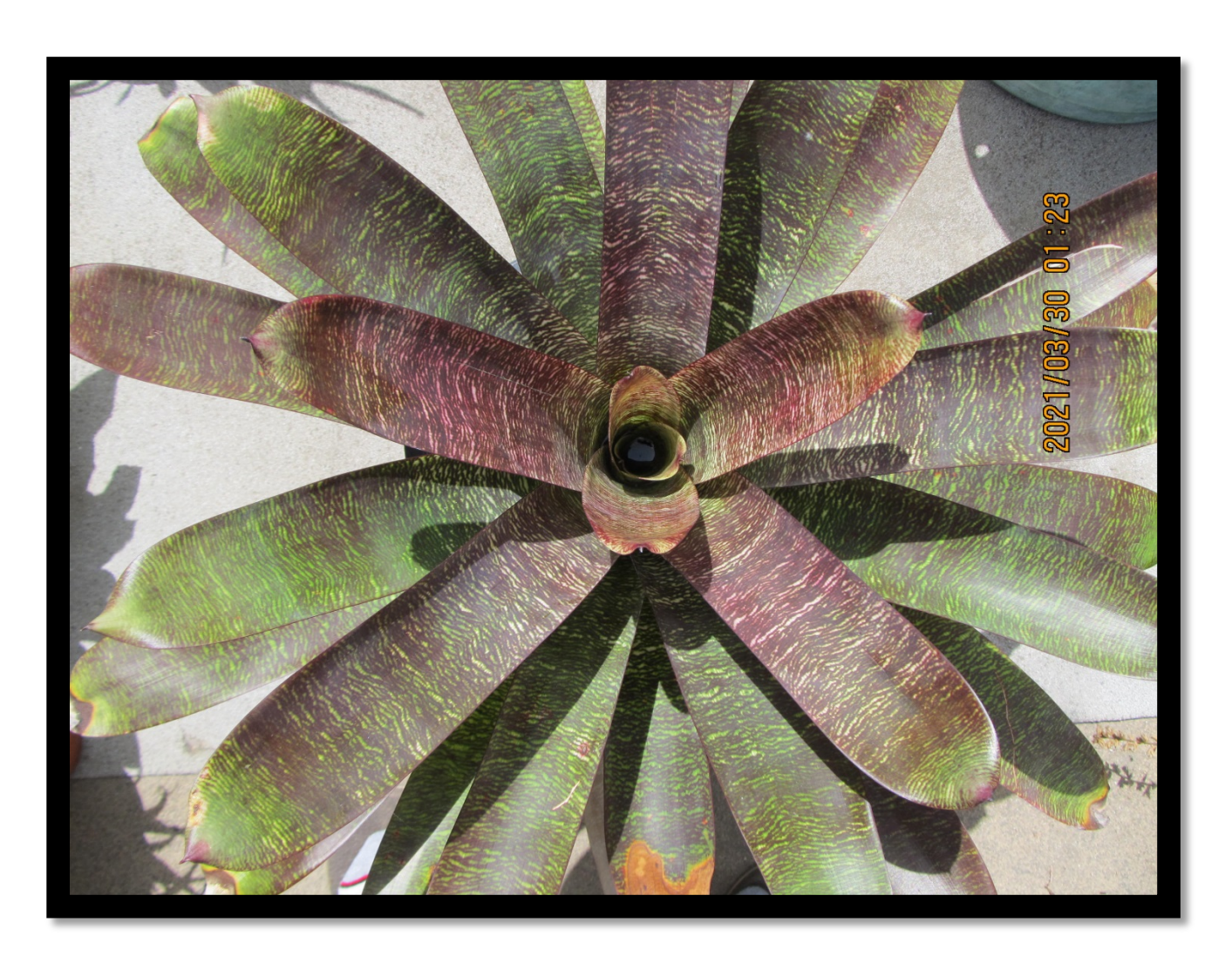
Vriesia "Pahoa Beauty" x fosteriana Plant and Photo submitted by Bryan Chan