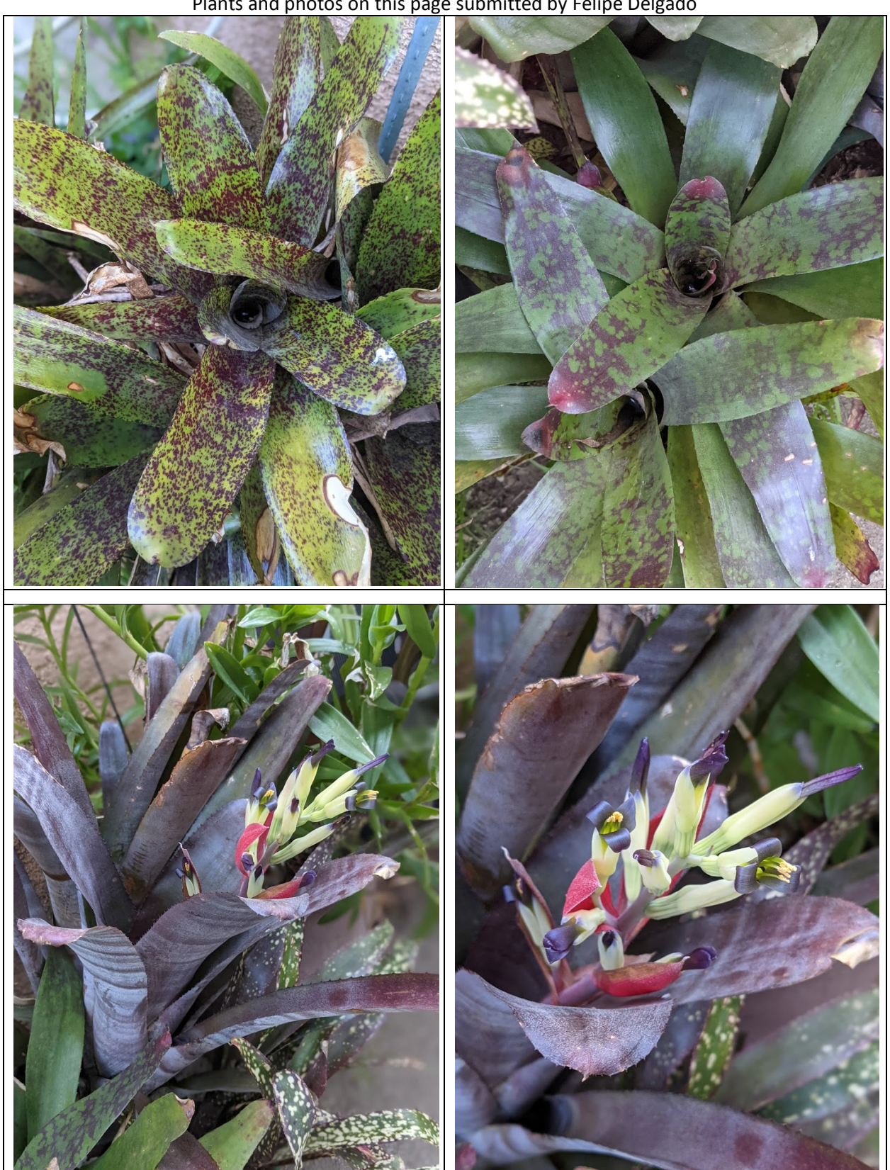
Raffle wins looking a little put upon by the sun.

Plants and photos on this page submitted by Felipe Delgado